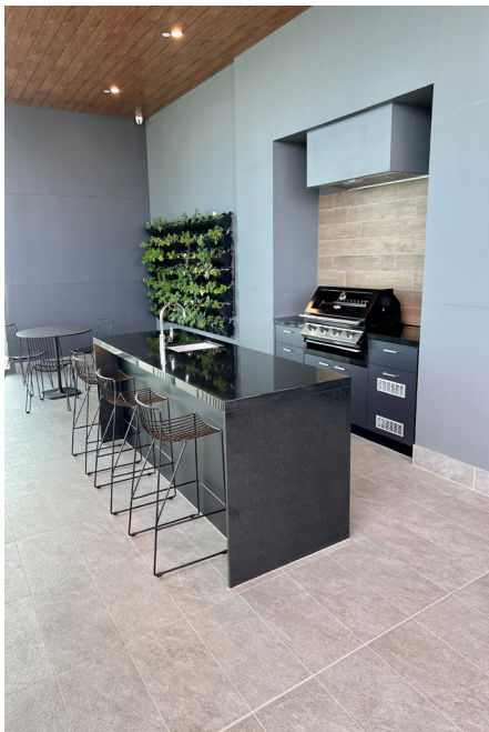
Entertainment area with a BBQ set for guests

Recently, Dribond Construction Chemicals had the opportunity to supply products to a construction project, AT238, 238 Adelaide Terrace Perth, which was being built by Hanssen. Dribond Construction Chemicals were able to fulfill the client's requirements, provide a suitable approach, and deliver exceptional results.