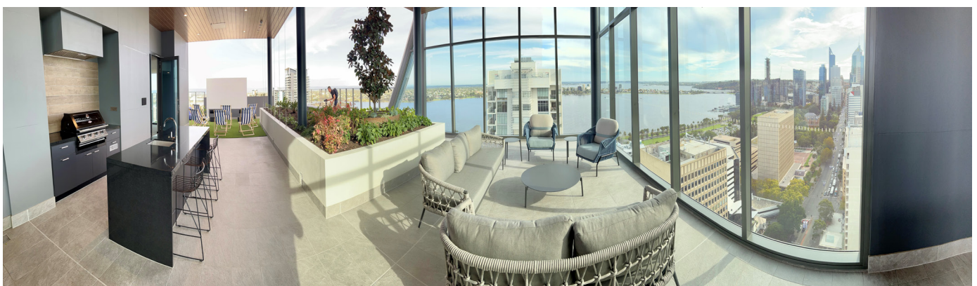
Rooftop entertainment area with panoramic views

Builder/Contractor: Hanssen